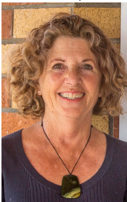
Hearts and Minds Shared Vision North