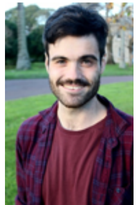
Panelist Spoken Word