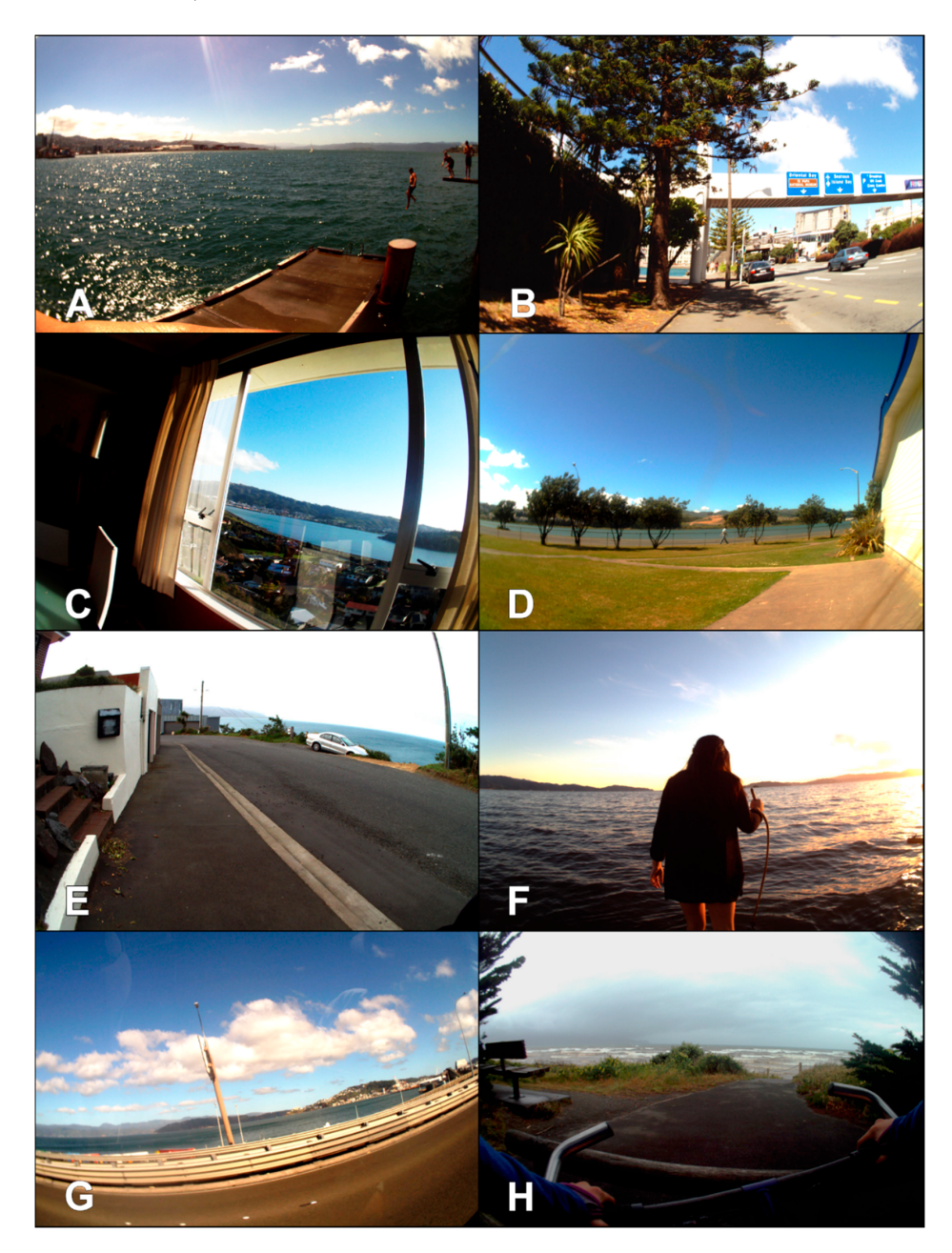
Figure 2. Example images for blue space exposures ( A ) blue recreation—swimming, ( B ) walking, ( C ) at home, ( D ) at school, ( E ) when alone, ( F ) with a peer companion, ( G ) in transit, and ( H ) blue recreation—biking.

Out of all the images processed (n = 691,606, equivalent to 1338.2 daylight hours), blue space was identified in 24,721 images (3.6%). Children were exposed to an average of 11.6 images/h containing blue space (95% CI: 5.3–18.0) for an average of 1.4 min/h (95% CI: 0.6–2.1) and 0.1 exposures/h (95% CI: 0.1–0.1). Children were exposed to 1.9 million blue space pixels (95% CI: 0–4.4 million). Children engaged in a total of 23 blue recreation events including hiking, biking along the coastline, swimming, horseback riding along a river, and taking a picnic at the water (see Supplementary Materials and Figure 2A–H for more details). On average, children engaged in 0.01/h blue recreation events (95% CI: 0.01–0.02).